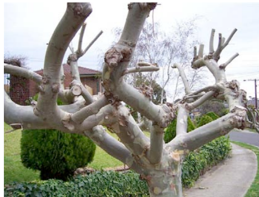
Photos 1 & 2. Example of a Plane tree that has been lopped and re-lopped. It shows the vigorous ability of the species to occlude wounds and graft or pleach branches.